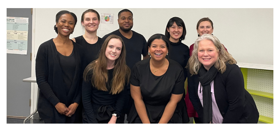
Classically trained singers from around the Central Virginia region auditioned to be a part of the Education Initiative.

It takes an artist with an educator's heart to win students to opera.