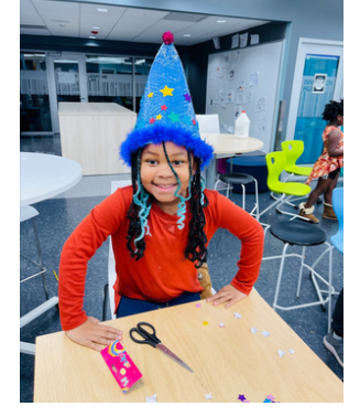
4. FIND YOUR PLACE - SETS AND PROPS